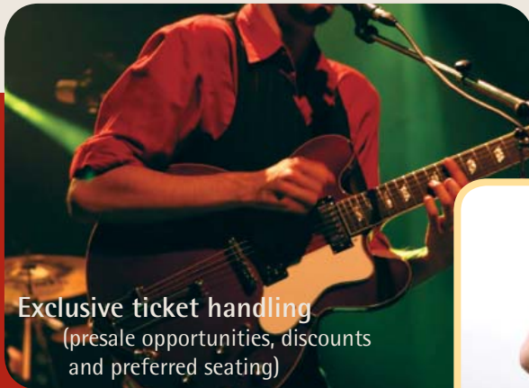
Exclusive ticket handling (presale opportunities, discounts and preferred seating)