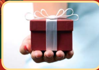
Speciality gift items for any occasion